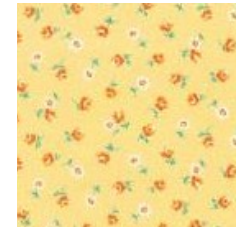
Fabric #24 9 X 21