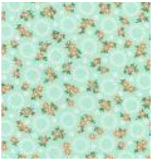
Fabric #9 7 X 21