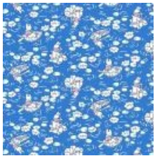
Fabric #17 7 X 21