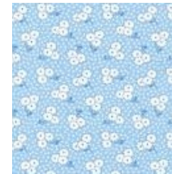
Fabric #14 7 X 21