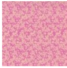
Fabric #19 7 X 21