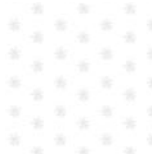
Fabric # 15 11 X 42