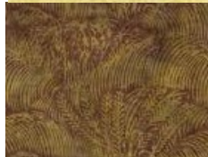
#32 12 X 14