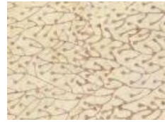
#14 12 X 14