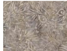
#34 5 X 5