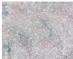
#30 5 X 21