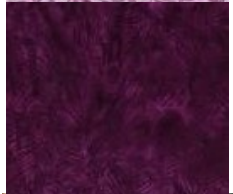
#26 7 X 7