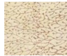
#14 5 X 5