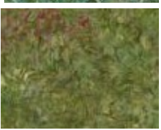
#20 7 X 21