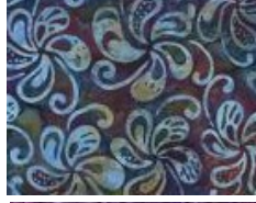
#2 12 X 7