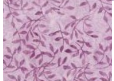
#27 7 X 7