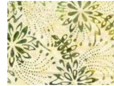
#36 5 X 5