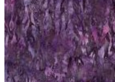
#21 14 X 5