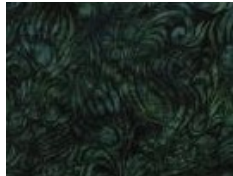
#6 16 X 5