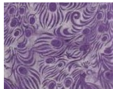
#9 9 X 5