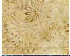
#11 27 X 7