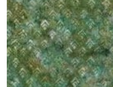
#1 5 X 5