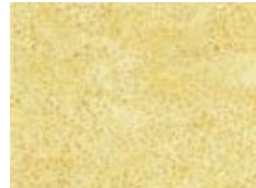
#5 12 X 21