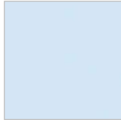
Background 10 x 42