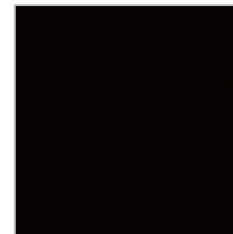
Eyes 3 x 5