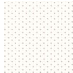
Background 64 X 42