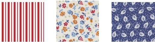
SMALL HEXAGON 6 c