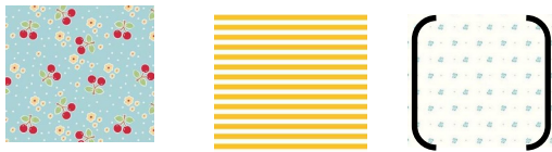
SMALL HEXAGON 6 e