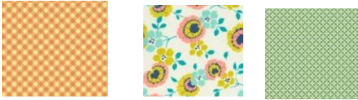
SMALL HEXAGON 6 a