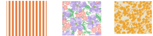
SMALL HEXAGON 6 d