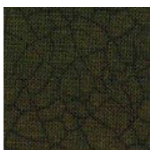
Green for hat band, bow and 16 patch

The pattern gives cutting directions for using with the Quilt In A Day Flying Geese ruler, or you may use any other method to end up with 3 1/2" x 6 1/2" blocks.