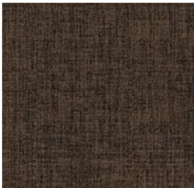
CROOK 7 X 21