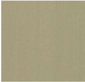
FACE 5 X 10.5