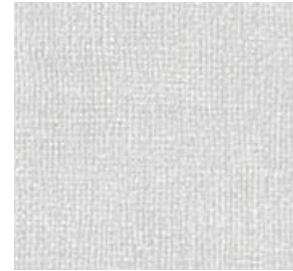
UNDER ROBE 7 X 21