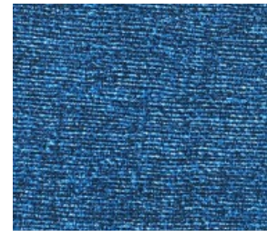
HEADBAND 3 X 10