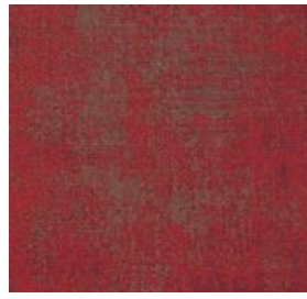
CAPE 12 X 14