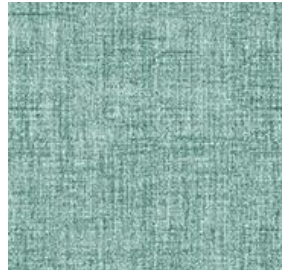
HEADSCARF 9 X 21