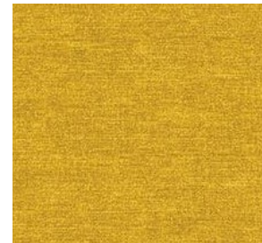
CROOK HANDLE 4 X 4