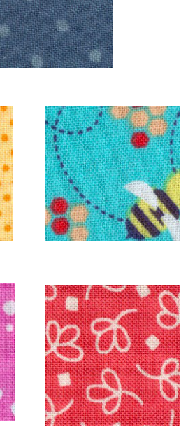
8 Assorted Bright Fabrics for Outer Circles: Pink pattern, aqua, mauve spot, orange spot, aqua with yellow, aqua, pink and mauve