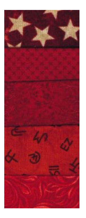
TEXAS LETTERS You may have different reds or a couple more reds that are of a different size, but there will be enough to cut the number of letters that you need.