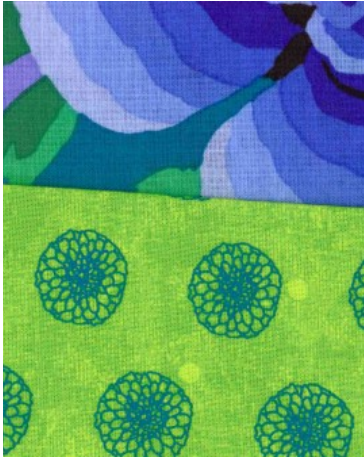
Prints for inner spikes

Spiky Borders & Finishing You may receive different fabrics than pictured