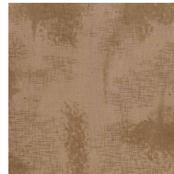
Fabric G 8 X 11