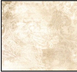
Fabric A 9 X 17