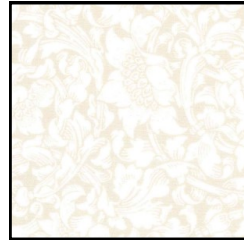
Fabric B 5 X 12