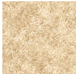
Fabric F 5 X 8