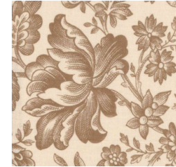
Fabric D 5 X 13