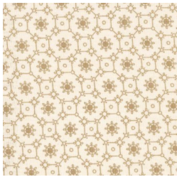
Fabric E 5 X 8