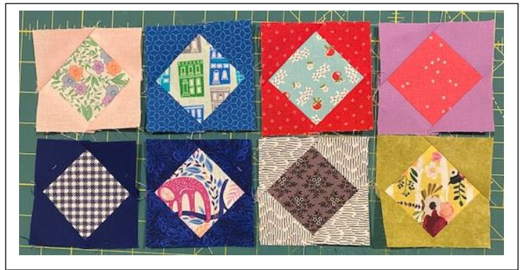
Ten (10) 4" finished (Choose color combinations you like)