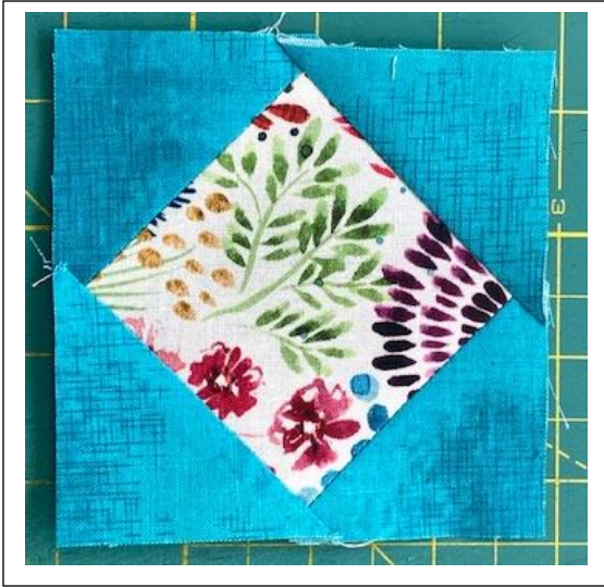
Final 3 1/2" finished block

For the 3" and 4" finished blocks, follow the directions above using the cuts shown in the pattern.